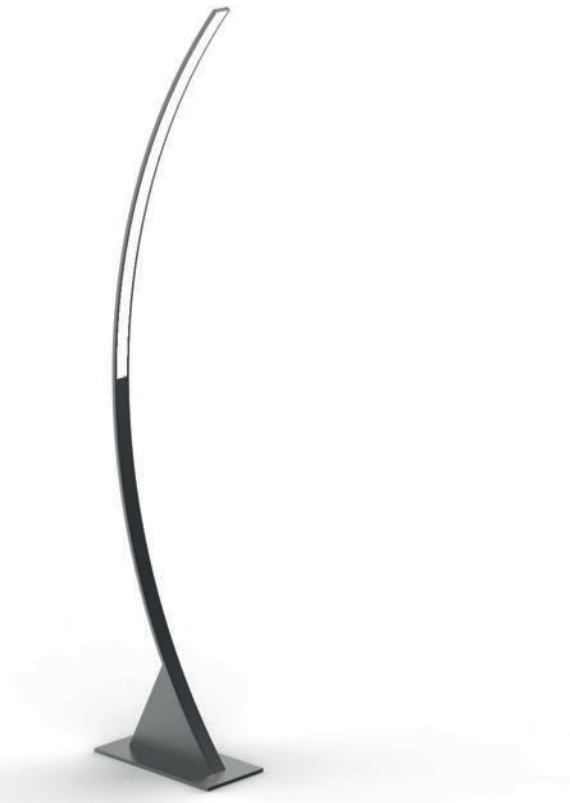
Floor decorative lighting